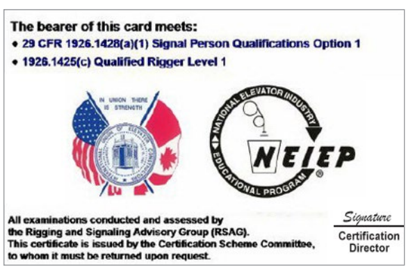
CSPR-1 Certification Card Back