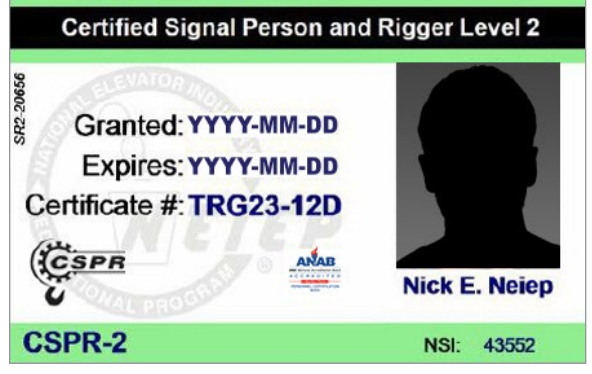
CSPR-2 Certification Card Front