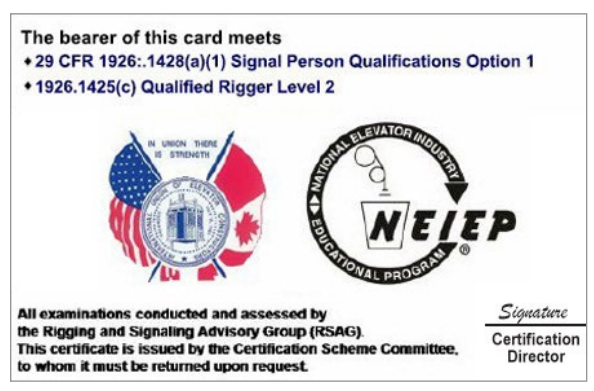
CSPR-2 Certification Card Back